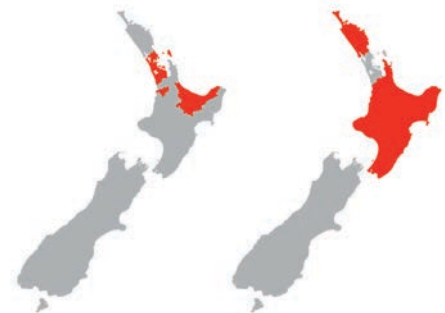
Auckland, Hamilton, Tauranga