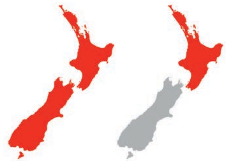
All of New Zealand

WE HAVE SEVERAL AREAS THAT YOU CAN SELECT FOR YOUR ONSSERT