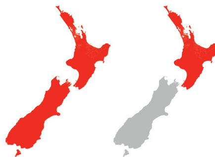
All of New Zealand

WE HAVE SEVERAL AREAS THAT YOU CAN SELECT FOR YOUR ONSSERT