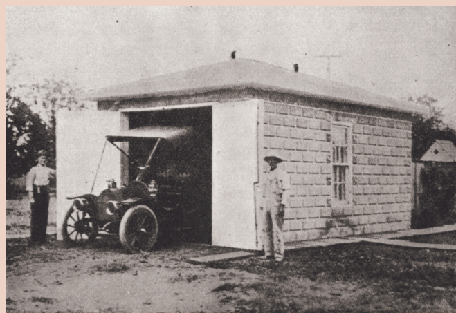
Figure 3: Concrete block garage circa 1919.