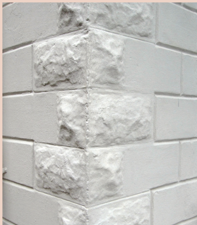
Figure 2: Rock-faced corners with fair-faced hollow concrete block walls in a 1904 Wellington house.

The growth in the use of concrete blocks led to the founding of the New Zealand Concrete Masonry Association (NZCMA) in 1956. Since 1983, concrete masonry unit manufacture has been harmonised – most recently in AS/NZS 4455.1 Masonry units, pavers, flags and segmental retaining wall units – masonry units and, since 1986, there has been a standard for smaller masonry buildings – most recently, NZS 4229:1999: Concrete masonry buildings not requiring specific engineering design . ◀