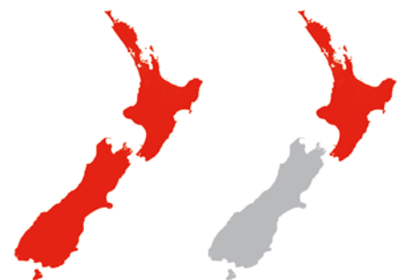
All of New Zealand

WE HAVE SEVERAL AREAS THAT YOU CAN SELECT FOR YOUR ONSERT