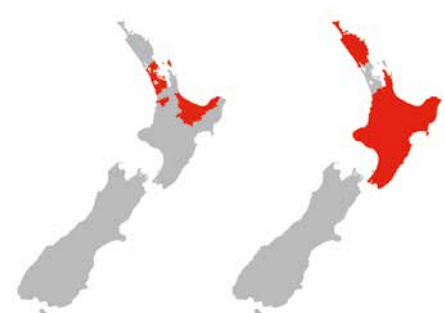
Auckland, Hamilton, Tauranga