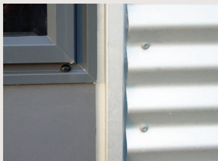
Figure 1: Detailing junctions between different claddings is much easier for new construction than for extensions.

The reasons for this include the difficulty and risks associated with: →