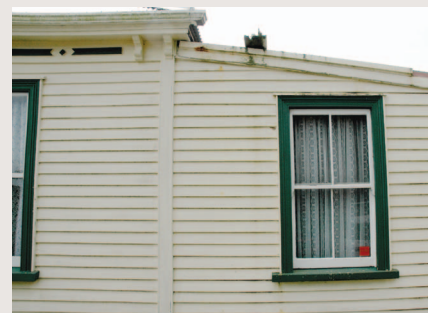
Figure 2: A cover board is the easy way to join weatherboards.