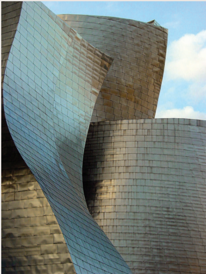
Figure 4: Interlocked cladding systems will be more difficult to merge at a junction.

A second more difficult option involving a lot more work is to remove some of the existing bricks to allow the new bricks to be seamlessly integrated into the bond pattern. The integration will be more seamless where an exact colour match is possible. ◀