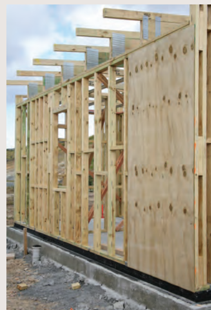
Example of structural plywood use.